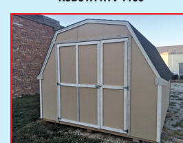
10X14 PORTABLE SHED

→ VIEW PICTURES AT WWW.WESTCENTRALSALSAUCTION.COM ← FOR MORE INFORMATION, QUESTIONS, OR TO CONSIGN, PLEASE CONTACT: