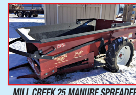
MILL CREEK 25 MANURE SPREADER - LIKE NEW