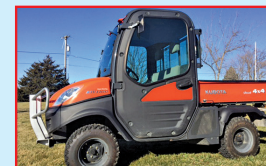
KUBOTA RTV 1100