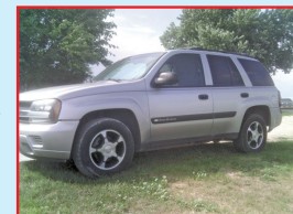
2004 CHEVY TRAILBLAZER

TIRES: New 225-75-15's, 8-ply on 5-bolt or 6-bolt rims; new 11.00 15 8-ply wagon tires; new 235 85-16 10-ply on 8-bolt or 6-bolt rims; new 205-75-15 6-ply on 5-bolt rims.