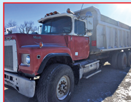
MACK DUMP TRUCK