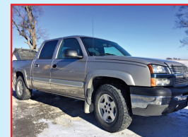
2004 CHEVY SILVERADO