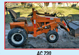
AC 720 W/LOADER