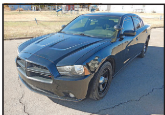
HI9012 '12 Dodge Charger Police