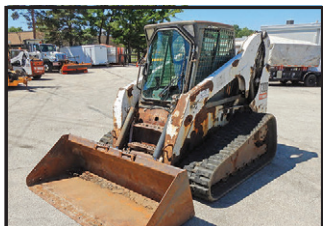
DI7523 '07 Bobcat T300 tracked skid steer