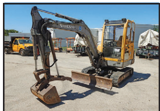
DI7537 '01 Volvo EC35 mini excavator