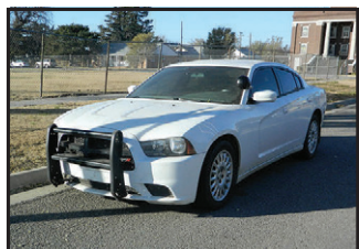
DF4583 '14 Dodge Charger Police