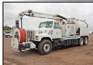
HD9139 '99 Int'l 2554 sewer jetter truck