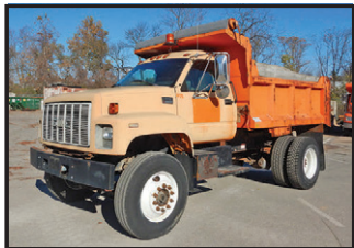
HV9513 '97 GMC C8500 dump truck