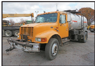
DH0521 '98 Int'l 4900 oil distributor truck