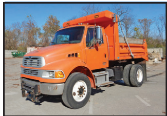
HV9514 '09 Sterling Acterra dump truck

230+ ITEMS SELL NO RESERVE! TUESDAY, DEC. 15