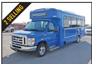
DY9573 '15 Ford Econoline E450 Super Duty shuttle bus

INVENTORY INCLUDES: DUMP BED PICKUP TRUCK: (2) '02 Ford F350 Super Duty PASSENGER VEHICLES: '15 Ford Taurus Police Interceptor, '07 Toyota Prius, '06 Ford Crown Victoria Police VIBRATORY SINGLE DRUM ROLLER: '87 Bomag BW213PD DUMP TRUCK: '02 Int'l 4900 PICKUP TRUCKS: '10 Ford F150 SuperCab, '09 Chevy Silverado 1500 Crew Cab, '02 Ford F150 HANDICAP ACCESSIBLE VAN: '06 Ford E250 and more. All items are sold "AS IS." 10% buyers premium applies.