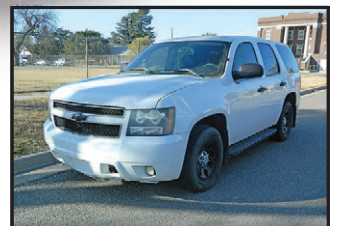
DF4582 '11 Chevy Tahoe Police SUV