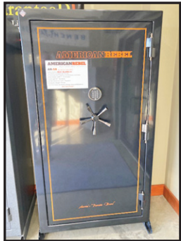
American Rebel CR-50

We also offer full service delivery and installation.