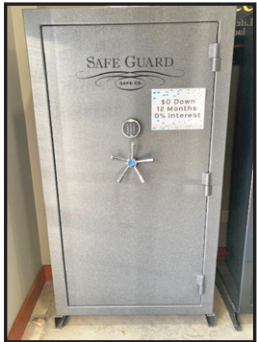
Safe Guard CR-45