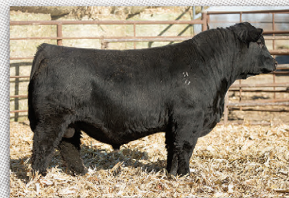
LOT 22 | 1/2 SM 1/2 AN | ASA: 3700271 SIRE: KR CASINO 6243