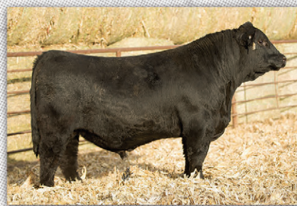
LOT 27 | 1/2 SM 1/2 AN | ASA: 3746660 SIRE: KR CASINO 6243