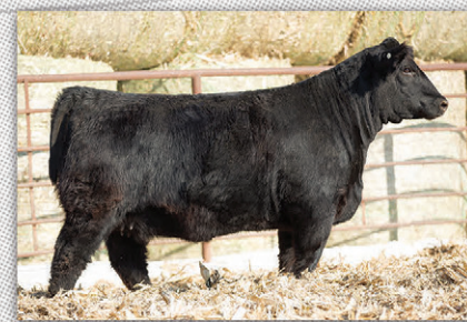
LOT 89 | PB SM | ASA: 3594797 SIRE: RUBY SWC BATTLE CRY 431B

85 BULLS 15 BRED HEIFERS SIMMENTAL & SIMANGUS YEARLING AND 18-MONTH-OLDS