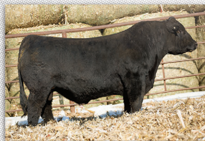
LOT 1 | PB SM | ASA: 3594707 SIRE: RUBYS TURNPIKE 771E

FEBRUARY 6, 2021 AT 2:00 PM | AT THE FARM IN MURRAY, IA