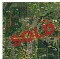
DECATUR COUNTY - 500 acres m/l