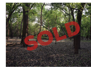
POLK COUNTY - 28.35 Acres m/l

GABE ADAIR SELLS A SOUTH CENTRAL IOWA FARM EVERY 11 DAYS.