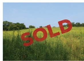
TAYLOR COUNTY - 200 acres