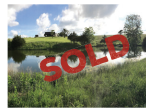
DECATUR COUNTY - 12 Acres m/l