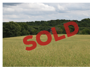
UNION COUNTY - 240 acres m/l