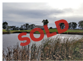
MADISON COUNTY - 161 acres m/l

MADISON CO, IA 126 ACRES M/L, Bottom ground tillable, Clanton Creek flows through the property, surrounded by big timber and CRP.