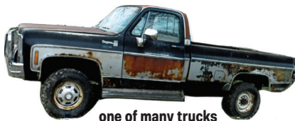
one of many trucks