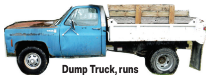
Dump Truck, runs