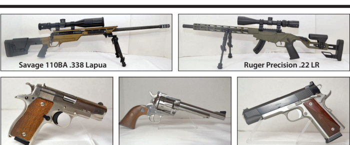
Savage 110BA .338 Lapua Ruger Precision .22 LR Iver Johnson Pony .380 Cal. Ruger New Blackhawk .357 Mag Springfield Armory 1911 Ronin 9mm