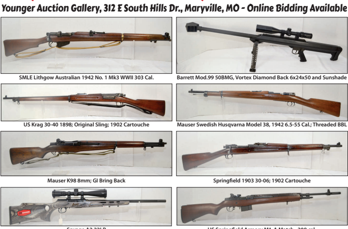
SMLE Lithgow Australian 1942 No. 1 Mk3 WWII 303 Cal. Barrett Mod.99 50BMG, Vortex Diamond Back 6x24x50 and Sunshade US Krag 30-40 1898; Original Sling; 1902 Cartouche Mauser Swedish Husqvarna Model 38, 1942 6.5-55 Cal.; Threaded BBL Mauser K98 8mm; GI Bring Back Springfield 1903 30-06; 1902 Cartouche Savage A2 22LR US Springfield Army M1-A Match, .308 cal.

Military & Sporting Rifles, Shotguns, Pistols, Ammo Remington - Winchester - Savage - Ruger - Smith & Wesson Sat., Nov. 11 - 10 am & Sun., Nov. 12 - 10:30 am Younger Auction Gallery, 312 E South Hills Dr., Maryville, MO - Online Bidding Available