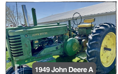
1949 John Deere A