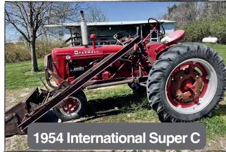
1954 International Super C