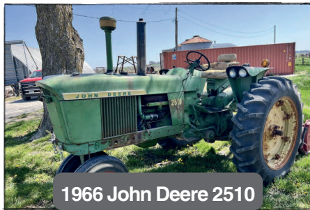
1966 John Deere 2510

Join us in-person or bid conveniently online.