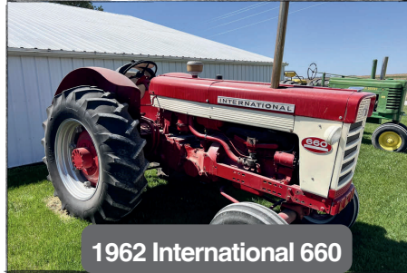
1962 International 660