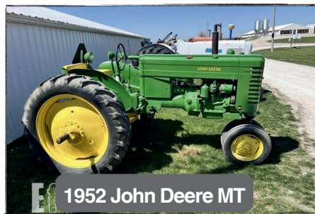
1952 John Deere MT