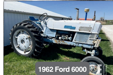
1962 Ford 6000