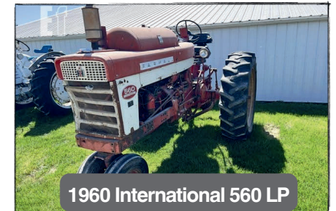
1960 International 560 LP