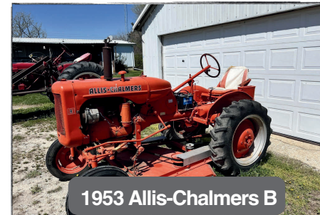
1953 Allis-Chalmers B