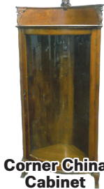
Corner China Cabinet