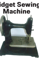
Midget Sewing Machine