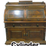
Cylinder Roll Desk